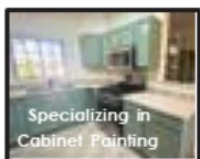
Specializing in Cabinet Painting